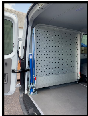
PN# 9ALPC553/PERF Internal swivel OPTIONAL