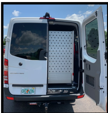
PN# 9ALPC553/PERF Stores just behind rear doors