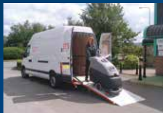
Commercial & Industrial Floor Cleaners