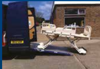
Medical Device Sales, Service, and Delivery