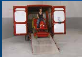
Pool & Lawn Care Service's