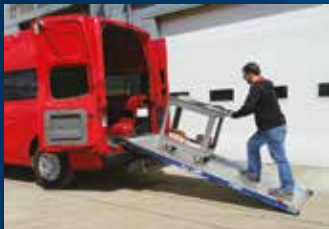
Plumbers & Electrician