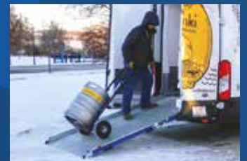
Catering & Wedding Performers