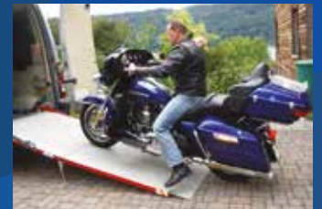
Motorcycle & ATV Transport