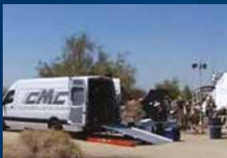
Event - DJ & TV move film crew